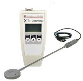
UV Curing Radiometer with a separate RCH-116-4 detector for measurement of high-power LED lamps in UV-A and blue light radiation curing

One essential quality feature of photometric devices is their precise and traceable calibration. The RCH-116-4 detector is calibrated for standard Curing LED wavelengths: 365 nm, 375 nm, 385 nm, 395 nm, 405 nm, and 430 nm . The calibration is performed by Gigahertz-Optik's ISO 17025 calibration and testing laboratory allows highest accuracy since is