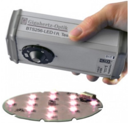
Compact spectroradiometer with internal integrating sphere