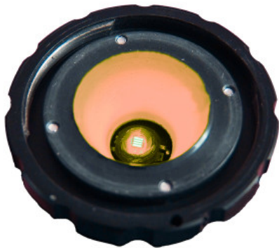
The conical measurement port is placed over the test LED and detects all the radiation in a 2pi space

One essential quality of measuring devices is their precise and traceable calibration. Calibration of the BTS256-LED-IR is performed in Gigahertz-Optik's ISO/IEC 17025 calibration laboratory that is accredited by DAkkS (D-K-15047-01-00) for the spectral responsivity and spectral irradiance according to ISO/IEC 17025. The device has two calibrations: one is done using a specially developed reference lamp offering 2pi illumination which enables precise measurement of the luminous flux of diffusely emitting LEDs. The second calibration is for sources that have narrower illumination characteristics.