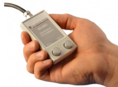
UV-A Irradiance and Illuminance Detector

Both detectors have a cosine corrected field of view for accurate spatial responsivity.